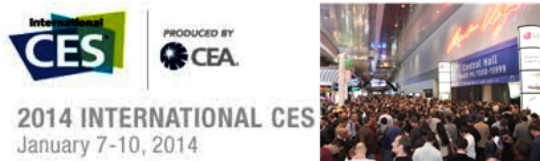
Fig. 3. Consumer Electronics Show 2014 held in Las Vegas, Nevada.

The market facts speak for themselves. The global wholesale level market for battery control technology was nearly $86 billion in 2011 and should grow to more than $124 billion (constant 2012 dollars) by 2016 under a consensus scenario, a Compound Annual Growth Rate or CAGR of 7%. Battery chargers currently represent the largest of the three (3) battery control technology market sectors, with 2011 sales of about $48 billion. BCC expects this market to reach $69.6 billion by 2016, a CAGR of 7.6%. They are followed by smart batteries (including both nickel metal hydride and lithium-ion), especially those used in portable products and on-road electric vehicles. Smart batteries represented a $32 billion market in 2011, expected to grow to more than $49 billion by 2016, a CAGR of 8.5%. Lastly, battery conditioner shipments have grown over the last 5 years. Between 2011 and 2016, global sales are predicted to grow from $5.2 to $5.8 billion, a CAGR of 2.2%.