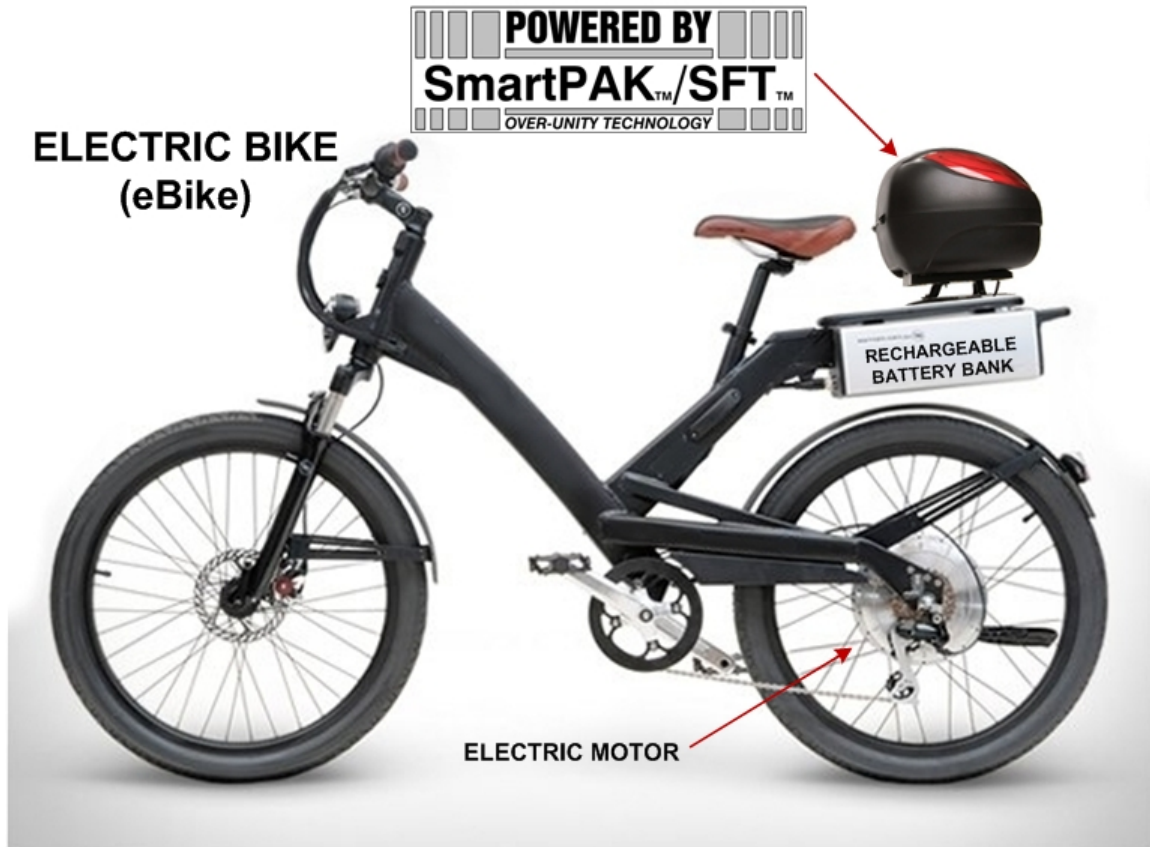
Fig. 4. An Electric Scooter fitted with the SmartPAK™ / SFT™ OU System.

CES is a four-day marathon event and runs January 7 - 10.