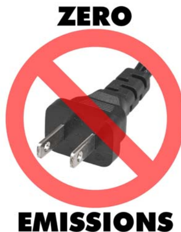
Fig. 2. Our ZERO EMISSIONS Logo.

AuroraTek, Inc., a leader in Self-Sustainable Technologies, has on its’ bench a working prototype device that has an efficiency of 127% with a theoretical efficiency of over 3,200%. Our objective is to get this technology to the market place and change the way the world produces and utilizes energy. With this technology, “the age of burning fossil fuel” is over; “the age of dangerous fission” is over; “the age of dangerous fusion” (which never got started) is over; and “the age of alternative energy technologies” is over!