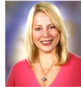
Aurora Light VP of Investor Relations and Special Projects